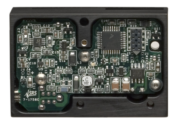
SR475 Shutter Head with cover removed, revealing control system electronics

The 3 mm clear aperture (SR475) is designed for easy alignment and is large enough to be used with common light sources. Typical rise and fall times are under 500 \mu s, and repetition rates from DC to 100 Hz can be used. Unlike other shutters, the SRS shutter is not duty cycle limited — you can run any duty cycle you choose. The SR476 has a 1 mm clear aperture and supports repetition rates to 125 Hz.